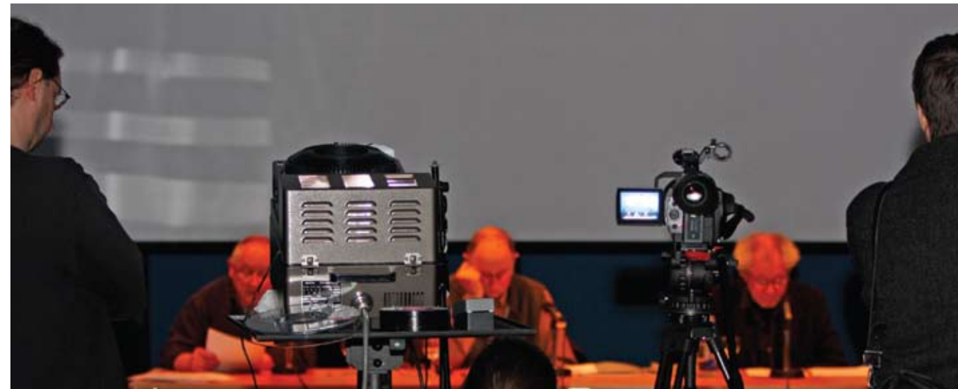
Art & Language, Not Quite the Belacqua Pose - A Talk in Three Voices , 2008, performance, Our Literal Speed, 1 March 2008, ZKM, Karlsruhe