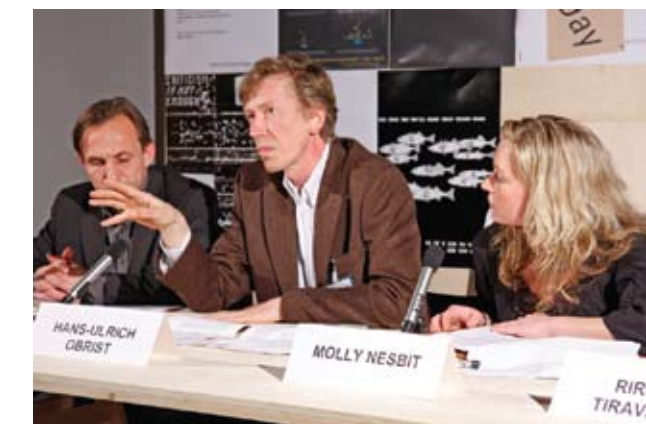
Jackson Pollock Bar, Utopia Station 2003, 2008 , an installed theory installation, Our Literal Speed, 29 February 2008, ZKM, Karlsruhe

Sharon Hayes will present "micro" "small" "phone" "voice" loud speaking and other early histories in the lobby of the Smart Museum of Art at 9:30pm